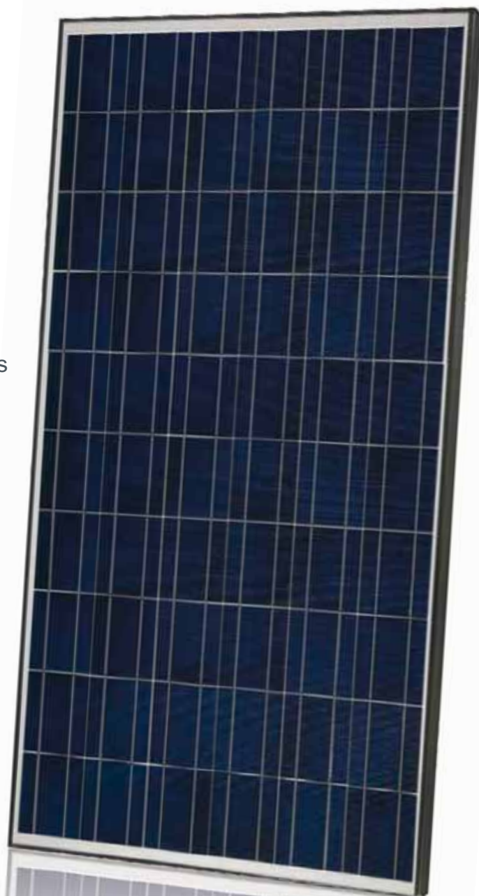
Polycrystalline | 60 cells GSP6-210/215/220/225/230/235